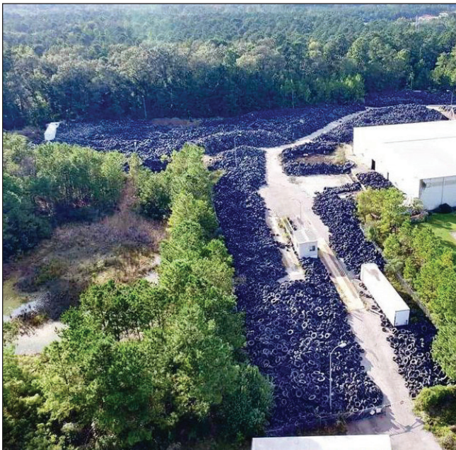
Pictured (left) is the Viva Tire Recycling Facility in 2017 – before more than 1 million tires were removed – and after cleanup (right) was completed in February 2019.