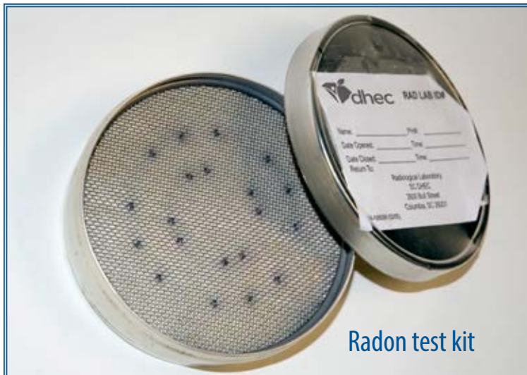
Radon test kit

The U.S. Environmental Protection Agency (EPA) has an action level for radon at 4.0 picoCuries/liter (pCi/L). This means you should install a radon reduction system in your home if the radon level is 4 pCi/L or higher. Radon reduction systems are installed by qualified professionals and the cost is similar to other common home repairs. Levels below 4 pCi/L can also pose a health risk and in many cases can be reduced. You can reduce your risk of lung cancer by lowering your radon levels.