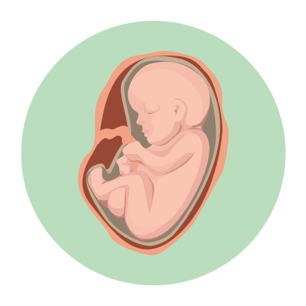
Drawings illustrate relative size of fetal growth only. They are not scientifically accurate representations of fetal development.