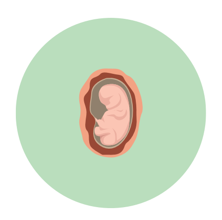
Drawings illustrate relative size of fetal growth only. They are not scientifically accurate representations of fetal development.