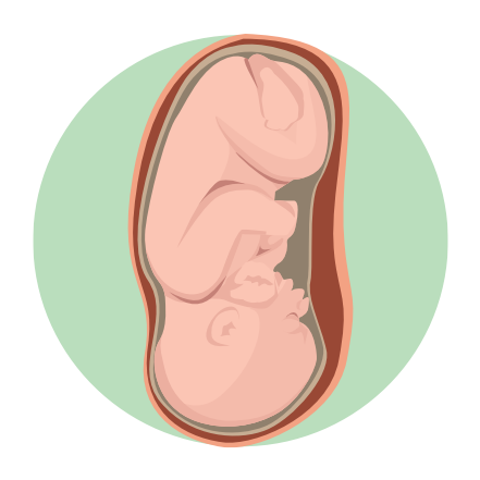
Drawings illustrate relative size of fetal growth only. They are not scientifically accurate representations of fetal development.