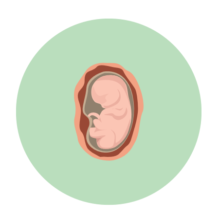
Drawings illustrate relative size of fetal growth only. They are not scientifically accurate representations of fetal development.