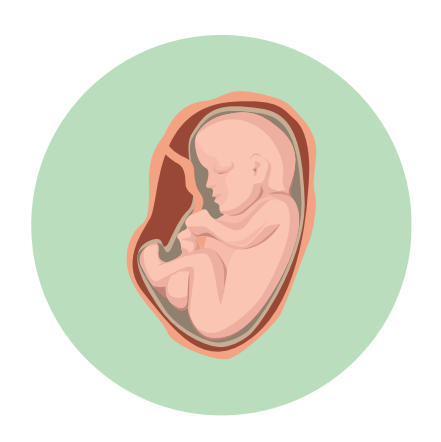
Drawings illustrate relative size of fetal growth only. They are not scientifically accurate representations of fetal development.