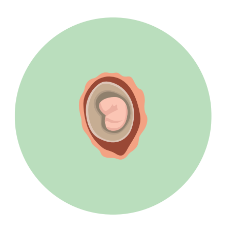
Drawings illustrate relative size of fetal growth only. They are not scientifically accurate representations of fetal development.