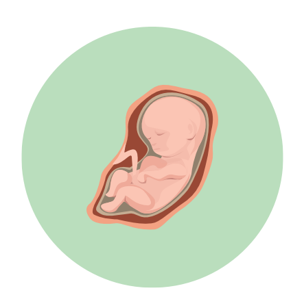
Drawings illustrate relative size of fetal growth only. They are not scientifically accurate representations of fetal development.