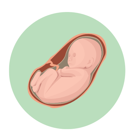
Drawings illustrate relative size of fetal growth only. They are not scientifically accurate representations of fetal development.