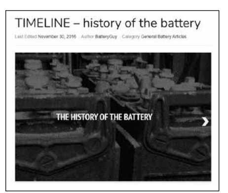
Timeline: History of the Battery