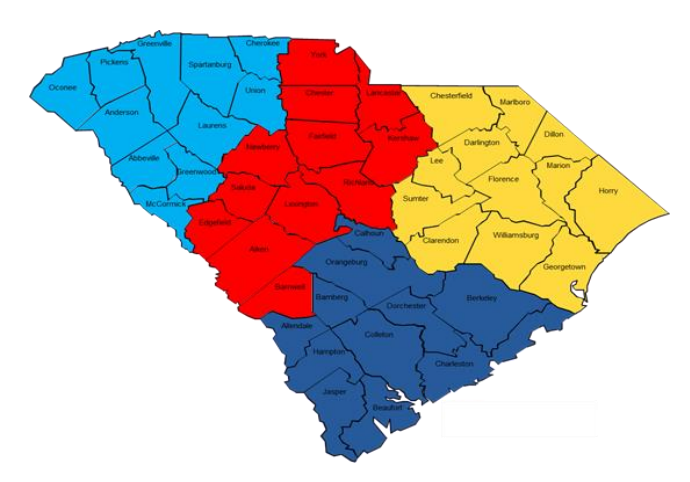
ILI Percentage by Geographic Region