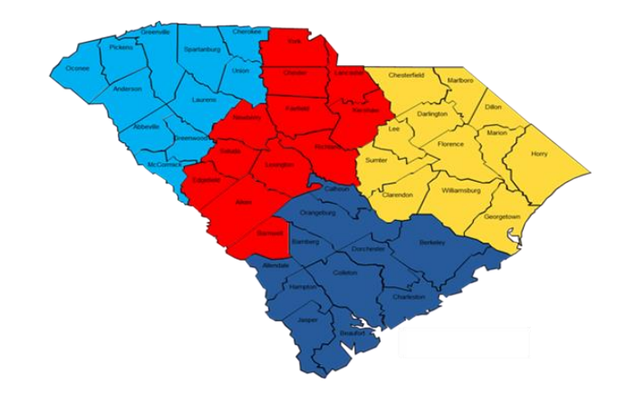
ILI Percentage by Geographic Region