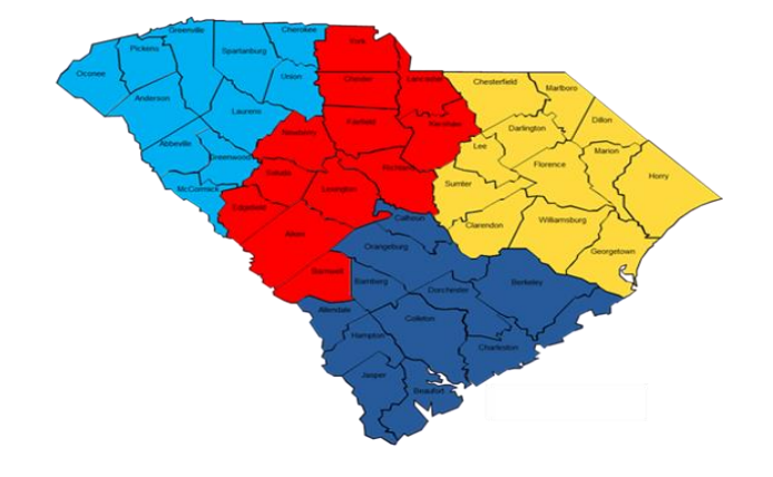
ILI Percentage by Geographic Region