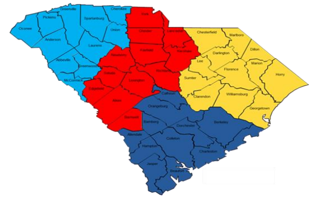
ILI Percentage by Geographic Region