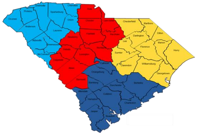
ILI Percentage by Geographic Region