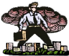
ENHANCED OZONE AWARENESS

Flexible work hours tend to reduce the heavy concentrations of ozone-forming emissions associated with peak commuter traffic, because more workers are freed up to commute during non-peak hours. Additionally, the overall volume of automobile emissions are reduced because commuter traffic is less clogged, idling (a major source of NOx emissions) is reduced and everyone's commute time is shortened.